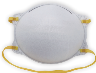
Item No. PRN95240*